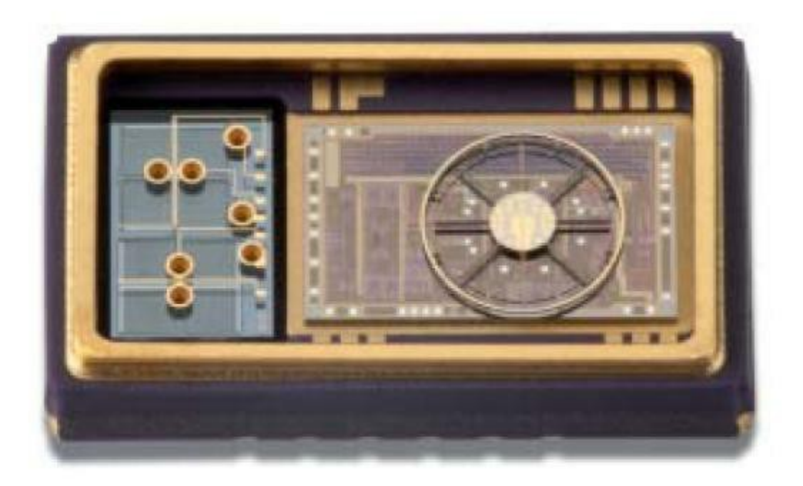
Image of the ring gyroscope system on the right, mounted onto the semiconductor chip containing interface electronics. This presents a true marvel of micro-engineering. The area on the left with a bue tint is the highly accurate Orion class accelerometer. The SP-9 contains three of these devices.

Three Orion class accelerometers provide extremely accurate and drift free acceleration measurement while a further three high range accelerometers are employed to cover the range from 10G to 16G.