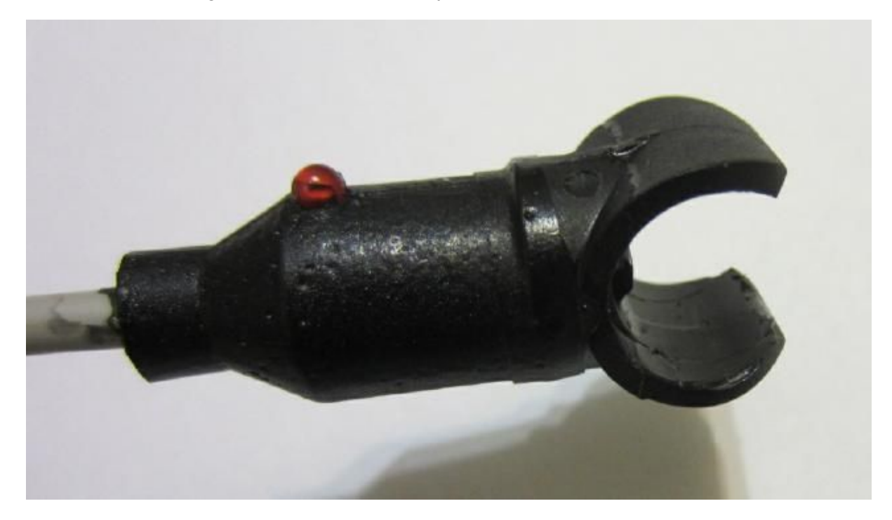
Image of the moulded sensor body. It clips onto the sensor body. The body contains the sensor and a small micro processor used to linearise the flow reading derived from the vortex suspended rotating object in the sensor housing.