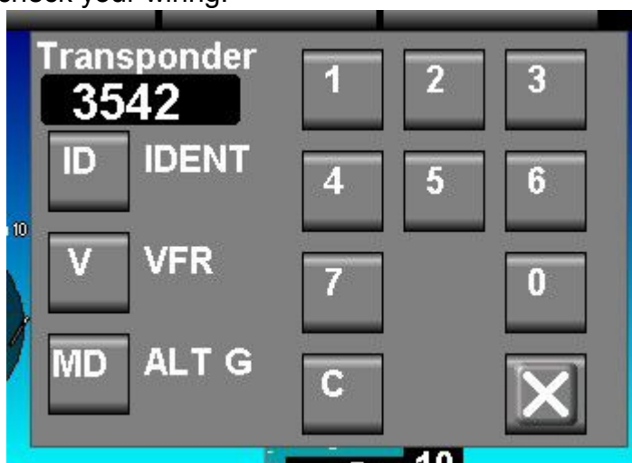
Transponder item from an iEFIS system.

In both cases, with the transponder connected and powered, the transponder screen item should not have a red cross. If it has a red cross, then the EFIS is not communicating with the transponder. Please check your wiring.